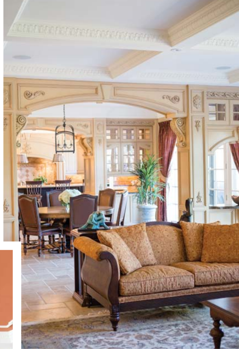
BELOW: Intricate mouldings, a ceiling medallion and a candelabra-style light fixture add to the formal feel of the dining room. A stunning arrangement of white hydrangeas from Brant Florist provides a fresh and lovely centrepiece. RIGHT: Oversized sofas and a large rug create a cosy great room just off the kitchen. OPPOSITE: Dramatic architectural details continue with the mouldings and cabinetry in the large culinary kitchen. Ornate embellishments add to the traditional atmosphere.